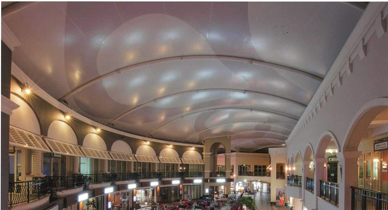
Chevron Renaissance Shopping Center Design, Engineering & Fabrication: MakMax Australia